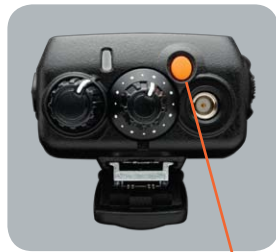
Dedicated Programmable Emergency Button

Industrial and commercial workplace safety programs require emergency preparedness when accidents or hazardous situations arise. This includes a plan to alert help instantly. The Emergency alert function is programmed by your Dealer and is designated to transmit an emergency notice on a specified channel. With a press of a button, the radio transmits an emergency alert to call for help or to notify others to implement the emergency action plan.